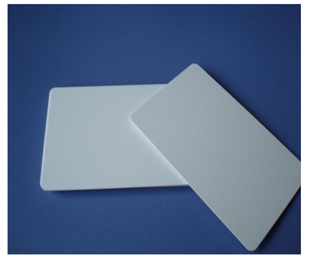
Fig 2: RFID User cards